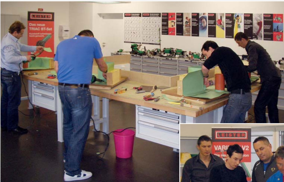
The complete Leister tool range is available in the new training room.

Trained Leister sales and service partners provide users with expertise in their own training rooms throughout the world. A good example of this is the company Haberkorn Ulmer. This innovative commercial company has taken advantage of a new building to establish a state-of-the art training room. Here you will find a complete range of Leister products for welding plastic. Not only will you find tools for roofing applications, but also those for other areas such as civil engineering, flooring, apparatus construction, tarpaulin manufacturing or industrial hot air applications. During the first quarter of 2011 alone, 26 training sessions were held with a total of 150 participants from all over Austria. Therefore, the investment has more than paid off for Haberkorn Ulmer.