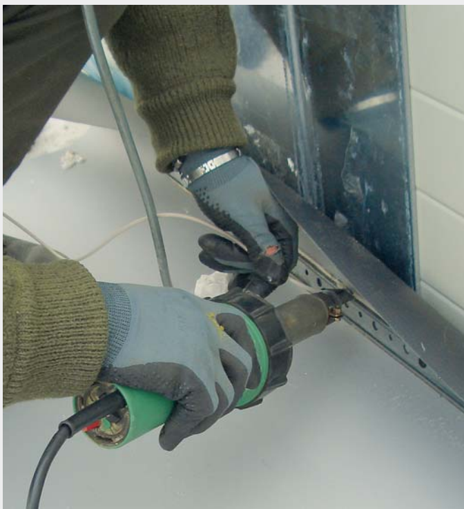
The TRIAC S was used for complex details or for draw welding on the fastening of boarding rails.

When it came to complex details such as draw welding at the fastening rails of the boarding, Reifetshammer utilized the proven and reliable hand tool, the TRIAC S.