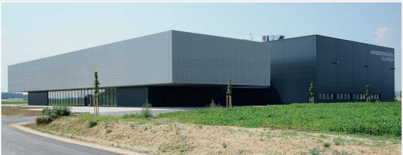
The attractive company building of Haberkorn Ulmer GmbH with a seminar and training section and a warehouse