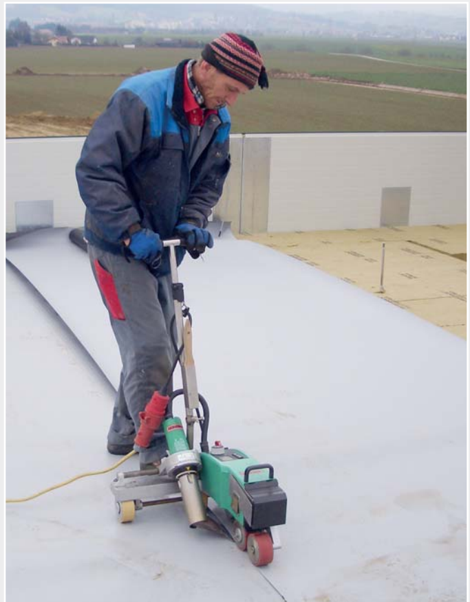
Ergonomic and neat working with the VARIMAT V2.

For Haberkorn Ulmer, it was something quite special to witness this important Leister tool in use on its own roof and hear testimonials regarding how well it performed. The maximum working speed of the VARIMAT V2 is twice that