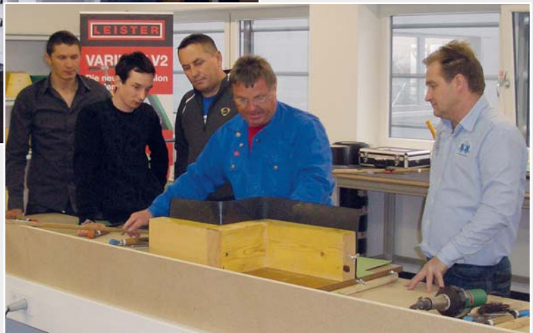
Technical explanations by a trained employee of Haberkorn Ulmer.

Building: Haberkorn Ulmer GmbH, Austria, www.haberkorn.com Architects: Poppe und Prehal GU: ARGE Alpine Swietelsky, Austria, www.swietelsky.at Building owner: Haberkorn Ulmer GmbH Roofers: Reifetshammer, Austria, www.reifetshammer.at Welding equipment: Leister Technologies AG, Switzerland, www.leister.com Leister Sales- und Service partners: Haberkorn Ulmer GmbH