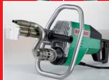
«Steering wheel» handle designed by welders