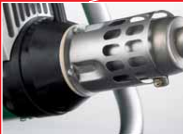
Maintenance free blower