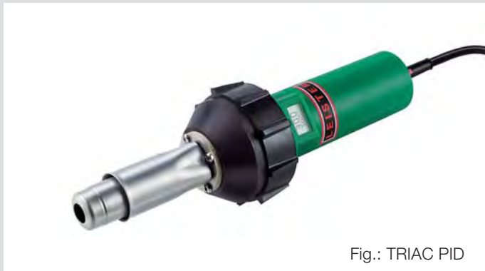
Fig.: TRIAC PID

Thanks to micro-processor controlled temperature and electronic monitoring. The preferred hand tool for welding with high quality.