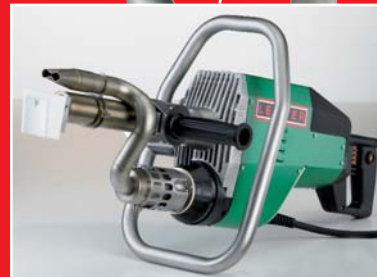
«Steering wheel» handle designed by welders