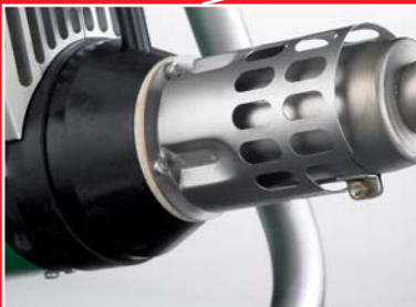
Maintenance free blower