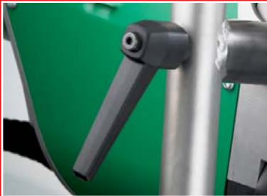
Symmetrical handle fixation mountable left and right